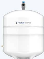
2-gallon hydropneumatic tank