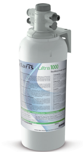
Head sold separately.

Claris Ultra 1000-L Filter Cartridge: EV4339-82