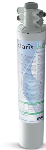
Head sold separately.

Claris Ultra 500-M Filter Cartridge: EV4339-81