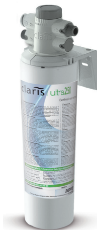
Head sold separately.

Claris Ultra 250-S Filter Cartridge: EV4339-80